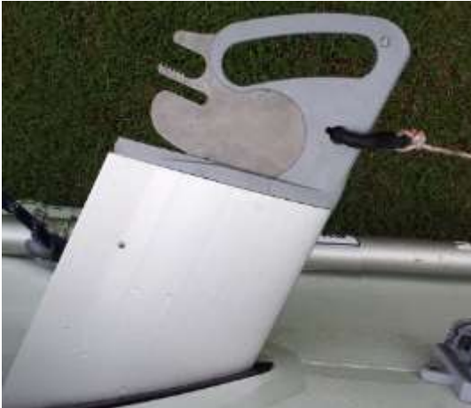
Safety clip attached to the shock cord

The large centreboard retaining safety clip is attached to your existing shock cord and is initially used to pull the board forward. This clip has multiple purposes and MUST always be fitted prior to leaving the beach and immediately the centreboard is inserted. The Safety clip secures the board into the boat, prevents you chopping your fingers off when they are in the handle and positions the centreboard for engagement into the gear block at the correct height.