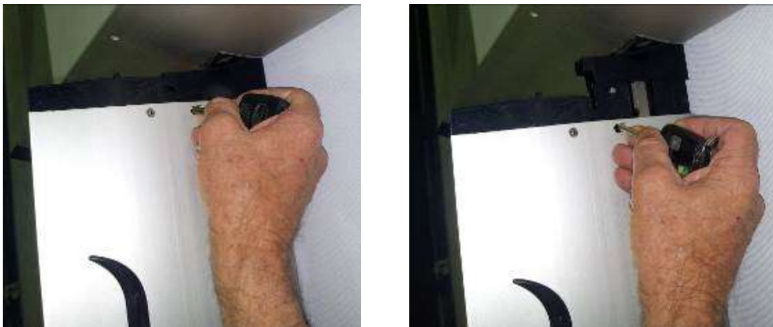
Depress the spring clip and pull the foils apart.

When returning to the beach, it is recommended to pull the foils apart for washing, transport and storage. To do this, depress the spring retaining clip with a key, or retaining hook as shown below.