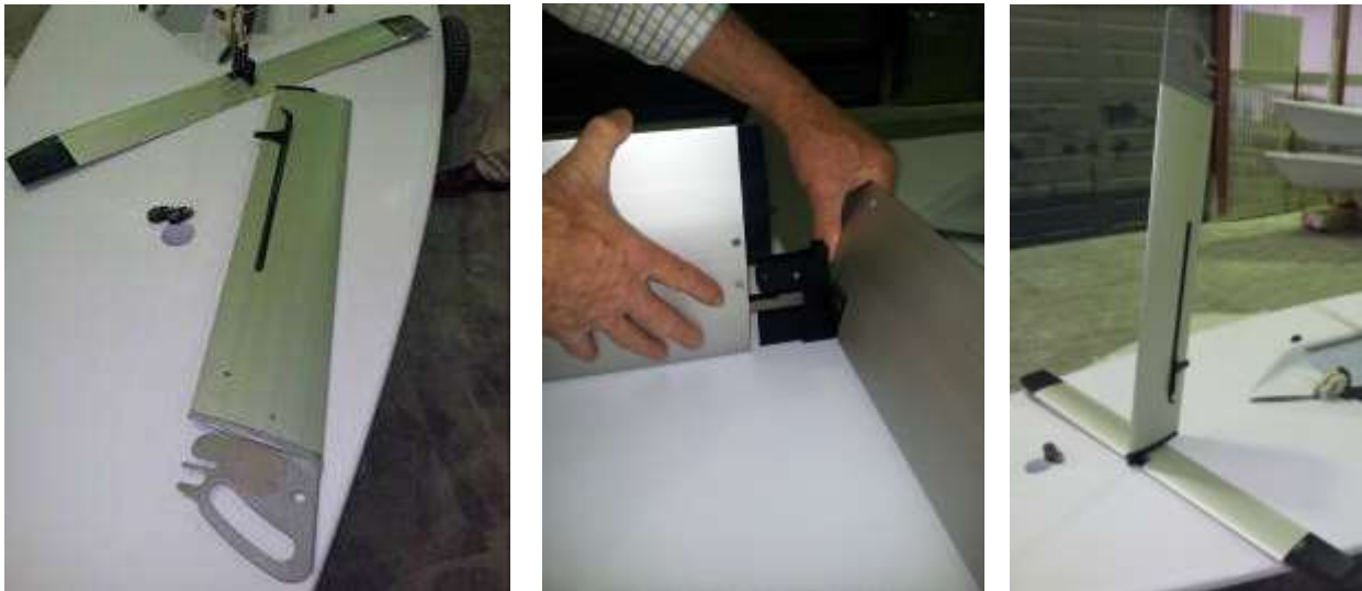
Assembly of Centreboard foil and lifting foil.

Assemble the centreboard by inserting the Tee joint in the horizontal foil, into the centreboard, push until the locking clip engages.