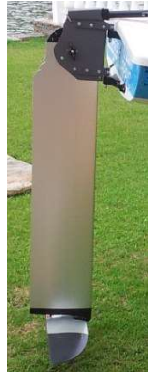
Rudder assembly including vertical rudder blade, horizontal foil and rudder box

As each Laser rudder mounting is subtly different due to the location of the gudgeon fittings, we provide a set of Glide Free spacers, specifically to suit our foiling kit and at the same time solve an age old problem of the tiller hitting the traveller cleat on the deck.