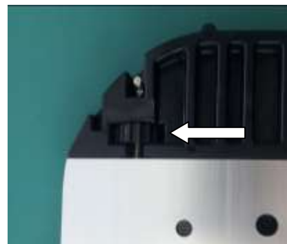
Thumb nut adjuster on rudder head for boat trim

A thrust washer is used in combination with a retaining clip which MUST be installed prior to foiling. Otherwise the rudder will come off the boat when you foil.