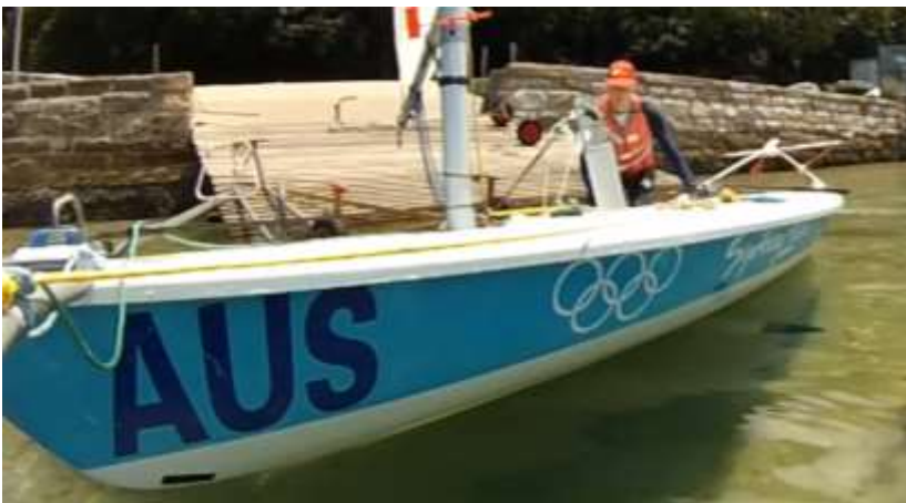
Launching in shallow water

b) Connect the safety clip immediately!. This is absolutely essential to prevent the foil falling out of the boat. Allow the board to be pulled forward, which holds/locks it at the appropriate height.