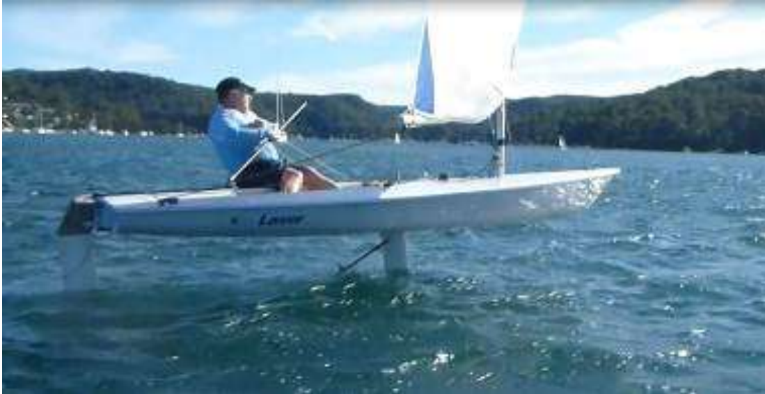
Glide Free Foils in action on a Laser dinghy