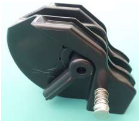
Gear block with toggle retaining pin inserted