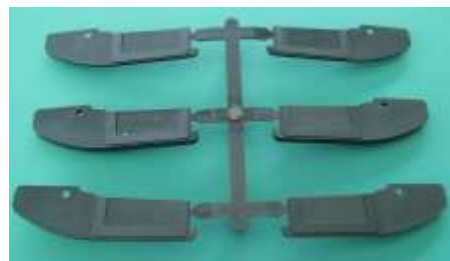
Gear block packers