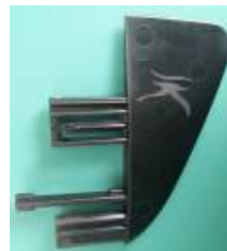
Low drag Delta “Speed foils” for high performance