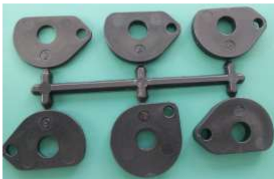
Spacer and thrust washer set

As each Laser rudder mounting is subtly different due to the location of the gudgeon fittings, we provide a set of Glide Free spacers, specifically to suit our foiling kit and at the same time solve an age old problem of the tiller hitting the traveller cleat on the deck.