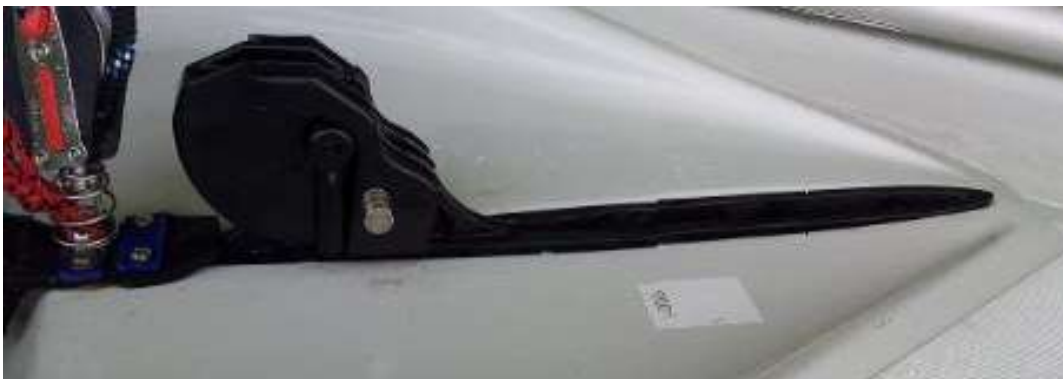
Gear block mounted on the centrecase insert with toggle pin inserted