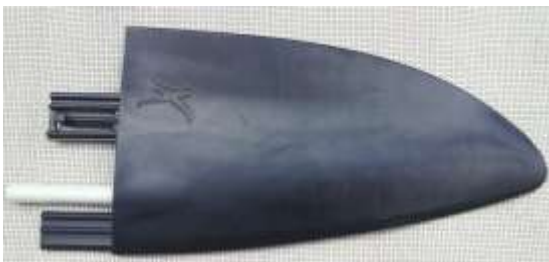
High lift Spitfire wingtip for light winds

For experienced skippers, we have developed the option of clip on wing tips. You can choose to sail with either high lift, Spitfire large tips or the smaller Delta wing “speed” foils for high speed sailing in strong breezes.